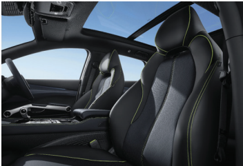
Black & Yellow